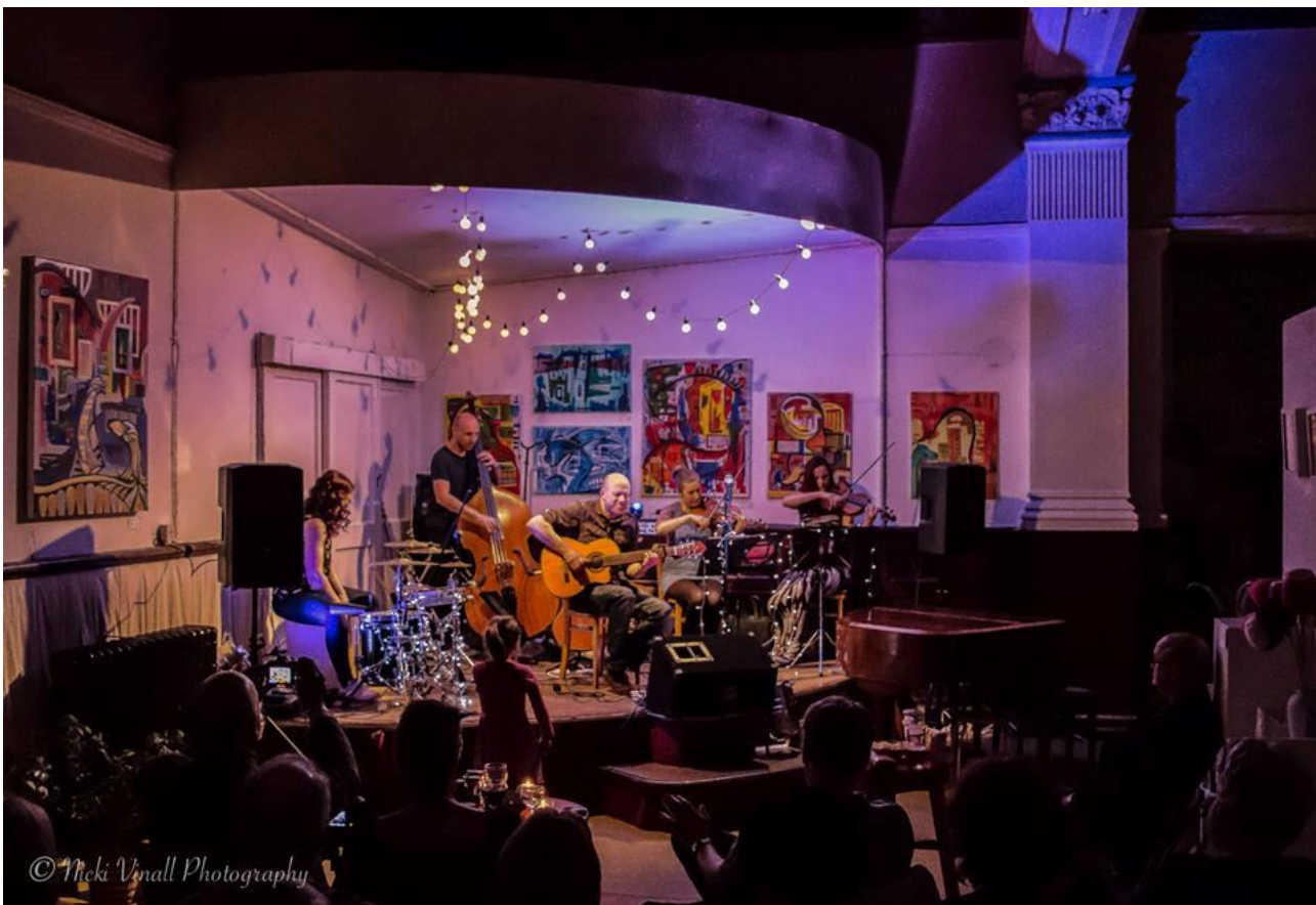
Skutch Manos performing on the ground floor stage. (Band's own lighting combined with gallery's fixed lights.) This performance took place in winter. We do not have blackout facilities.

For longer shows, timings are more relaxed as we can only fit in one full-length show per night.