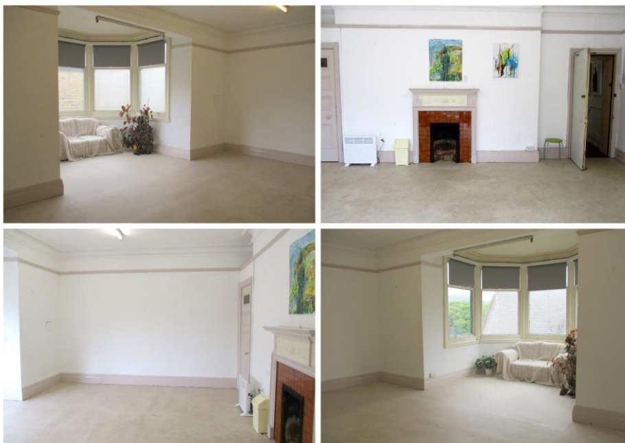
The Workshop Room. NB Flooring has been replaced. Now light grey vinyl.

Suitable for stand-up comedy; poetry, storytelling and other spoken word performances; children's events; very small-scale theatre such as one-person shows; small-scale musical performances; workshops and classes; rehearsals. (Floor plan on page 5.)