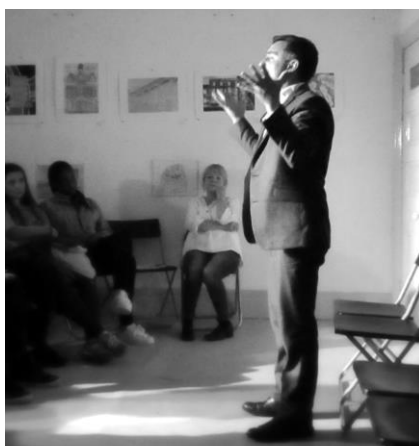
One man show in the Workshop Room

Hire charges: £35 for shows up to one hour with discounts for block bookings (as for Ground Floor Gallery). £15 per hour for workshops. £10 per hour for rehearsals.