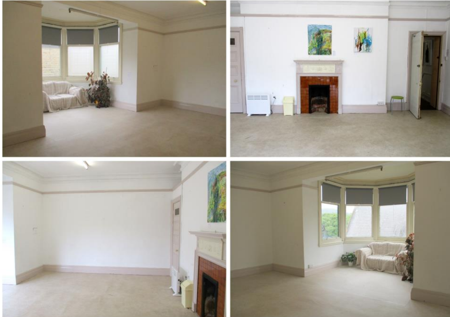
The Workshop Room. NB Flooring has been replaced. Now light grey vinyl.

Suitable for storytelling and other spoken word performances; children's events; very small scale theatre such as one-person shows; small-scale musical performances; workshops and classes; rehearsals. (Floor plan on page 5.)