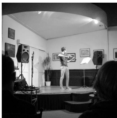
The corner stage (with the gallery's fixed lighting)

Stage: There is a small corner stage with a curved front edge. There are no wings and no backstage area.