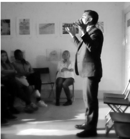
One man show in the Workshop Room Fringe 2016

Hire: £30 for shows up to one hour with discounts for block bookings. £15 per hour for workshops.