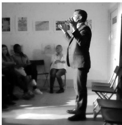
Performance in the Workshop Room Fringe 2016

Hire: £30 for shows up to one hour with discounts for block bookings. £15 per hour for workshops.