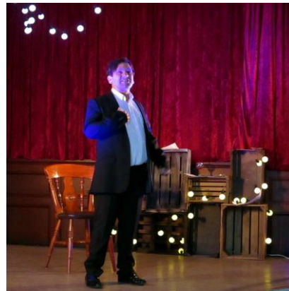
Performance on stage – Fringe 2016 (with theatre company's own lighting and drapes)

Seating capacity: Two areas close to the stage are used for audience seating. Maximum 60 with chairs on rows or 45 at café tables. It is also possible to have a combination of rows and tables. The rest of the room is taken up by fixed display screens exhibiting art work but it may be possible to use the exhibition spaces flexibly for some performances. (Floor plan on page 4.)