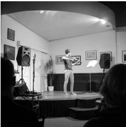
The corner stage (with the gallery's fixed lighting)

Stage: There is a small corner stage with a curved front edge. There are no wings and no backstage area although access can be created through a small store room behind the stage.